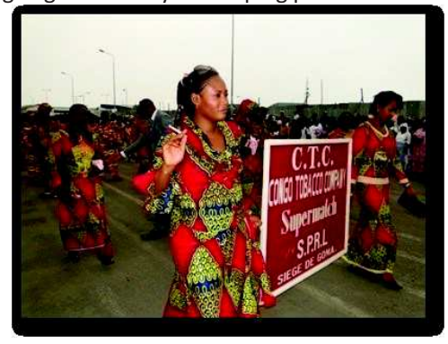
Congo Tobacco Company Celebration of Women in Goma, Eastern DRC, on Women's Day, March 8 2012

Marketing to women and girls who, in LMICs, have lower rates of smoking than men, is also widespread.<sup>50 51</sup> Efforts include using 'trend setters' to promote and normalise the image of the African woman smoker (see below) in an attempt to mollify the cultural barriers to female smoking. The industry's success is evidenced by the rising uptake of smoking in girls in many developing parts of the world.<sup>24</sup>